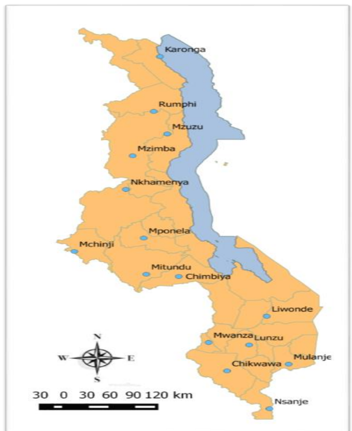
Figure 3. Location of markets

Since opening its markets across the country on 21 st October 2016, the main ADMARC depots in these markets have been reported to be selling maize only. As the ADMARC sales price has remained higher than market prices, very few sales by ADMARC have occurred. However, prices as high as MK250/kg, the ADMARC sales price, were reported by some traders in Mitundu, Chikwawa, and Nsanje during the month. No buying activity by ADMARC has been recorded since October 2016.