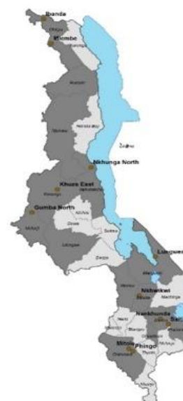
Figure 1. Map of Malawi and study districts

All districts (except Lilongwe) are covered in the household and community surveys; those shaded with gray are the 15 focus districts of the census of service providers; and those with dots are the locations on the focus group discussions.