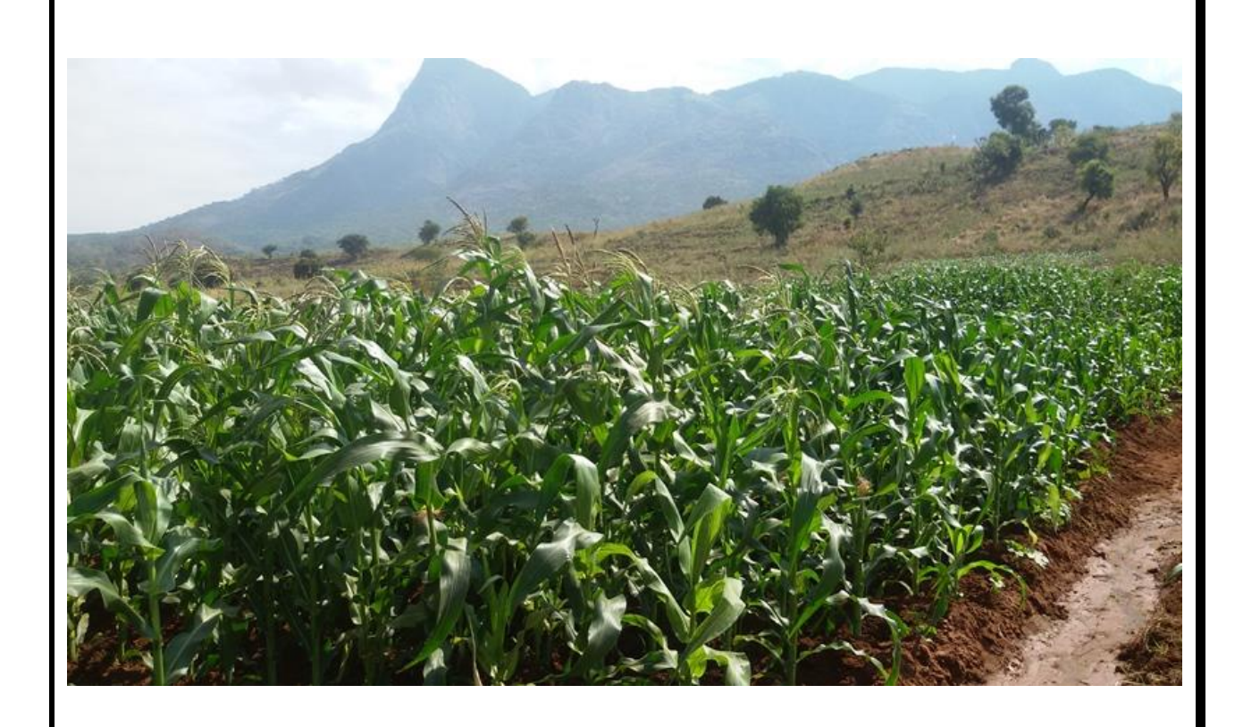
Office of the Vice President Department of Disaster Management Affairs August, 2016